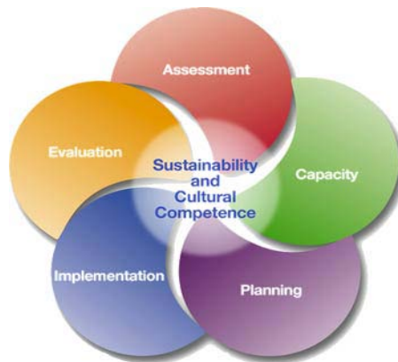
Strategic Prevention Framework

Evaluation: The coalition director conducts semi-annual, annual and biennial evaluations to assess the effectiveness of coalition strategies. In addition, the coalition contracts with an external evaluator to assess the broader, long-term impact of its strategy. The contractor's evaluation is done annually. Reports are presented to the coalition; upon conclusion of the evaluations the coalition reassesses the needs of the community and the process begins again, to come full circle.